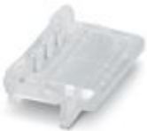
Ejector for COMBICON plug

Components of electronic housing - ME PS-17,5 MC TRANS - 2279842