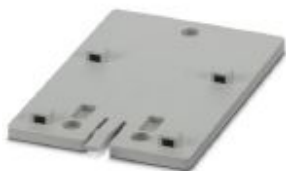
Wall bracket for housing

Please be informed that the data shown in this PDF Document is generated from our Online Catalog. Please find the complete data in the user's documentation. Our General Terms of Use for Downloads are valid ( http://phoenixcontact.com/download )