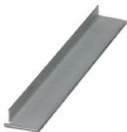
Connection technology adapters

Please be informed that the data shown in this PDF Document is generated from our Online Catalog. Please find the complete data in the user's documentation. Our General Terms of Use for Downloads are valid ( http://phoenixcontact.com/download )