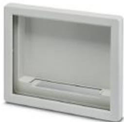
Display housing, 15", light gray, central window, front level, with cutout for connection technology angle plate consisting of two half shells with screws

Please be informed that the data shown in this PDF Document is generated from our Online Catalog. Please find the complete data in the user's documentation. Our General Terms of Use for Downloads are valid ( http://phoenixcontact.com/download )