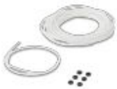
Sealing set, including cord and O-rings