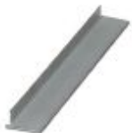
Connection technology adapters

Mounting brackets - DCS ADAPT CONNECT - 2203750