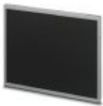
TFT module 15", 1024 x 768 pixels, transmissive/color, LED backlight, white, interface: LVDS, 8 bit, operating temperature: -20 °C ... 70 °C