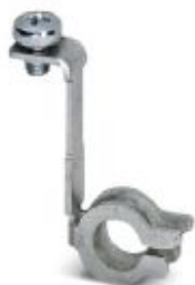
PE contact for UM-BASIC panel mounting base for connecting the PCB to the DIN rail at level 2

Please be informed that the data shown in this PDF Document is generated from our Online Catalog. Please find the complete data in the user's documentation. Our General Terms of Use for Downloads are valid ( http://phoenixcontact.com/download )