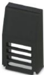
DIN rail housing, Filler plug for unoccupied terminal points, with vents, width: 21.35 mm, height: 13.67 mm, depth: 33.39 mm, color: black (9005)

Please be informed that the data shown in this PDF Document is generated from our Online Catalog. Please find the complete data in the user's documentation. Our General Terms of Use for Downloads are valid ( http://phoenixcontact.com/download )