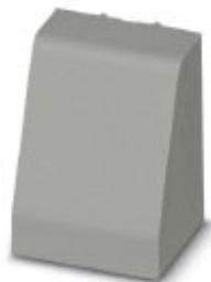
DIN rail housing, Filler plug for unoccupied terminal points, width: 16.3 mm, height: 13.67 mm, depth: 19.65 mm, color: light gray (7035)

Please be informed that the data shown in this PDF Document is generated from our Online Catalog. Please find the complete data in the user's documentation. Our General Terms of Use for Downloads are valid ( http://phoenixcontact.com/download )