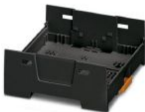
DIN rail housing, Lower housing part with base latch, flat design, width: 70.1 mm, height: 75 mm, depth: 30.3 mm, color: black (9005)

Please be informed that the data shown in this PDF Document is generated from our Online Catalog. Please find the complete data in the user's documentation. Our General Terms of Use for Downloads are valid ( http://phoenixcontact.com/download )