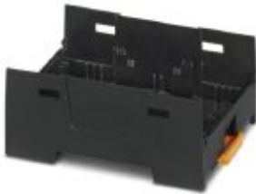
DIN rail housing, Lower housing part with base latch, flat design, width: 52.6 mm, height: 75 mm, depth: 30.3 mm, color: black (9005)

Please be informed that the data shown in this PDF Document is generated from our Online Catalog. Please find the complete data in the user's documentation. Our General Terms of Use for Downloads are valid ( http://phoenixcontact.com/download )