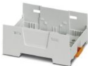
DIN rail housing, Lower housing part with base latch, flat design, width: 52.6 mm, height: 75 mm, depth: 30.3 mm, color: light gray (7035)

Please be informed that the data shown in this PDF Document is generated from our Online Catalog. Please find the complete data in the user's documentation. Our General Terms of Use for Downloads are valid ( http://phoenixcontact.com/download )