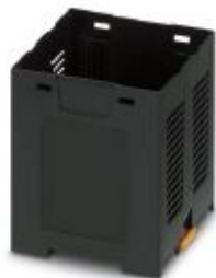
DIN rail housing, Lower housing part with base latch, tall design, with vents, width: 70.1 mm, height: 75 mm, depth: 87.3 mm, color: black (9005)

Please be informed that the data shown in this PDF Document is generated from our Online Catalog. Please find the complete data in the user's documentation. Our General Terms of Use for Downloads are valid ( http://phoenixcontact.com/download )