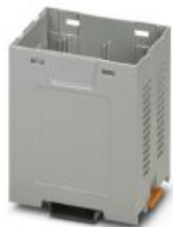
DIN rail housing, Lower housing part with base latch, tall design, with vents, width: 52.6 mm, height: 75 mm, depth: 87.3 mm, color: light gray (7035)

Please be informed that the data shown in this PDF Document is generated from our Online Catalog. Please find the complete data in the user's documentation. Our General Terms of Use for Downloads are valid ( http://phoenixcontact.com/download )