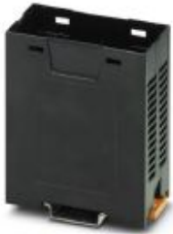
DIN rail housing, Lower housing part with base latch, tall design, with vents, width: 52.6 mm, height: 75 mm, depth: 87.3 mm, color: black (9005)

Please be informed that the data shown in this PDF Document is generated from our Online Catalog. Please find the complete data in the user's documentation. Our General Terms of Use for Downloads are valid ( http://phoenixcontact.com/download )