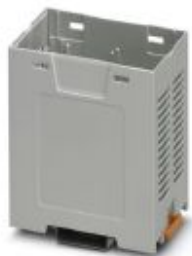
DIN rail housing, Lower housing part with base latch, tall design, with vents, width: 45.1 mm, height: 75 mm, depth: 87.3 mm, color: light gray (7035)

Please be informed that the data shown in this PDF Document is generated from our Online Catalog. Please find the complete data in the user's documentation. Our General Terms of Use for Downloads are valid ( http://phoenixcontact.com/download )