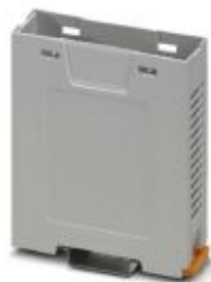
DIN rail housing, Lower housing part with base latch, tall design, with vents, width: 22.6 mm, height: 75 mm, depth: 87.3 mm, color: light gray (7035)

Please be informed that the data shown in this PDF Document is generated from our Online Catalog. Please find the complete data in the user's documentation. Our General Terms of Use for Downloads are valid ( http://phoenixcontact.com/download )