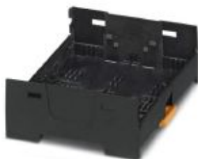
DIN rail housing, Lower housing part with base latch, flat design, width: 90.1 mm, height: 75 mm, depth: 30.3 mm, color: black (9005)

Please be informed that the data shown in this PDF Document is generated from our Online Catalog. Please find the complete data in the user's documentation. Our General Terms of Use for Downloads are valid ( http://phoenixcontact.com/download )