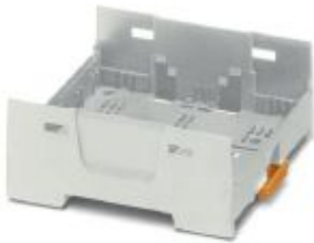
DIN rail housing, Lower housing part with base latch, flat design, width: 67.6 mm, height: 75 mm, depth: 30.3 mm, color: light gray (7035)

Please be informed that the data shown in this PDF Document is generated from our Online Catalog. Please find the complete data in the user's documentation. Our General Terms of Use for Downloads are valid ( http://phoenixcontact.com/download )