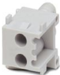
Contact insert module, for panel mounting frames for accommodating 2 optical fibers VC-FSMA-M ... Quick mounting connectors

Please be informed that the data shown in this PDF Document is generated from our Online Catalog. Please find the complete data in the user's documentation. Our General Terms of Use for Downloads are valid ( http://phoenixcontact.com/download )