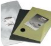
Polymer fiber polishing set, for F-SMA quick mounting connectors

Assembly tool - PSM-SET-FSMA-POLISH - 2799348