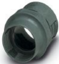
Corrugated tube screw connection, for flexible single wire entry, for connector housings, size Pg16

Please be informed that the data shown in this PDF Document is generated from our Online Catalog. Please find the complete data in the user's documentation. Our General Terms of Use for Downloads are valid ( http://phoenixcontact.com/download )