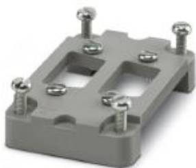
D-SUB adapter plate, for two D-SUB connectors, no. of positions 15, housing series HC-B 6...

Please be informed that the data shown in this PDF Document is generated from our Online Catalog. Please find the complete data in the user's documentation. Our General Terms of Use for Downloads are valid ( http://phoenixcontact.com/download )