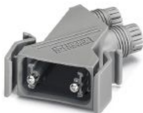
D-SUB sleeve housings, degree of protection: IP67, material: PA, cable outlet: Angled, size of housing: 1, color: gray

Please be informed that the data shown in this PDF Document is generated from our Online Catalog. Please find the complete data in the user's documentation. Our General Terms of Use for Downloads are valid ( http://phoenixcontact.com/download )