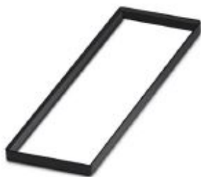
Replacement seal for size 2 sleeve

Please be informed that the data shown in this PDF Document is generated from our Online Catalog. Please find the complete data in the user's documentation. Our General Terms of Use for Downloads are valid ( http://phoenixcontact.com/download )