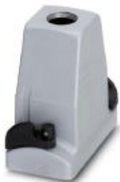
HEAVYCON ADVANCE EMV sleeve housing B10, with bayonet locking, height 100 mm, with 1x M25 thread, straight cable outlet

Please be informed that the data shown in this PDF Document is generated from our Online Catalog. Please find the complete data in the user's documentation. Our General Terms of Use for Downloads are valid ( http://phoenixcontact.com/download )