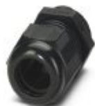
Cable gland, cable gland material: PA, external cable diameter 11 mm ... 17 mm, shielding: no, connecting thread: M25 x 1.5, color: jet black RAL 9005

Cable gland - G-INS-M25-M68N-PNES-BK - 1411134