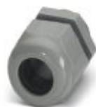
Cable gland, cable gland material: PA, external cable diameter 11 mm ... 17 mm, shielding: no, connecting thread: M25 x 1.5, color: silver-gray RAL 7001

Cable gland - G-INS-M25-M68N-PNES-GY - 1411126