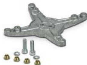
VESA 75/100 connection plate with M5 mounting kit for DCS 15" display support, die cast aluminum, 80 g

Please be informed that the data shown in this PDF Document is generated from our Online Catalog. Please find the complete data in the user's documentation. Our General Terms of Use for Downloads are valid ( http://phoenixcontact.com/download )