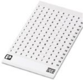
Marker card, self-adhesive, horizontally labeled with the consecutive numbers: 51 ... 60, 10-section marker strips with 14 identical decodes, white

Please be informed that the data shown in this PDF Document is generated from our Online Catalog. Please find the complete data in the user's documentation. Our General Terms of Use for Downloads are valid ( http://phoenixcontact.com/download )