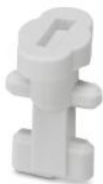
Locking element for locking the PCB onto UM-BASIC/PRO housing at level 3

Please be informed that the data shown in this PDF Document is generated from our Online Catalog. Please find the complete data in the user's documentation. Our General Terms of Use for Downloads are valid ( http://phoenixcontact.com/download )