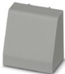
DIN rail housing, Filler plug for unoccupied terminal points, width: 21.35 mm, height: 13.67 mm, depth: 19.65 mm, color: light gray (7035)

Please be informed that the data shown in this PDF Document is generated from our Online Catalog. Please find the complete data in the user's documentation. Our General Terms of Use for Downloads are valid ( http://phoenixcontact.com/download )