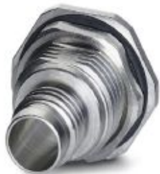
M8 pin, rear mounting

Please be informed that the data shown in this PDF Document is generated from our Online Catalog. Please find the complete data in the user's documentation. Our General Terms of Use for Downloads are valid ( http://phoenixcontact.com/download )