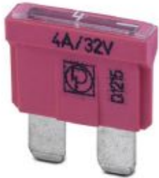
Flat-type plug-in fuse, type C, color code: pink, nominal current: 4 A

Please be informed that the data shown in this PDF Document is generated from our Online Catalog. Please find the complete data in the user's documentation. Our General Terms of Use for Downloads are valid ( http://phoenixcontact.com/download )