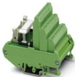
VARIOFACE sensor module, for connecting 8 p-n-p sensors, with LED

Please be informed that the data shown in this PDF Document is generated from our Online Catalog. Please find the complete data in the user's documentation. Our General Terms of Use for Downloads are valid ( http://phoenixcontact.com/download )