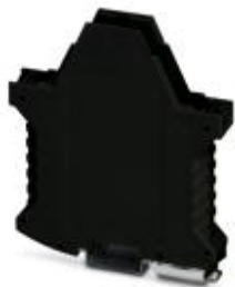
Component housing, length: 99 mm, Lower part, Cross connection: DIN rail bus connector, color: black, width: 17.5 mm, height: 114.5 mm

Please be informed that the data shown in this PDF Document is generated from our Online Catalog. Please find the complete data in the user's documentation. Our General Terms of Use for Downloads are valid ( http://phoenixcontact.com/download )