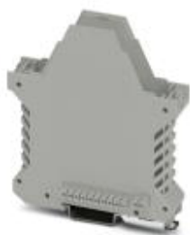
Component housing, color: gray

Please be informed that the data shown in this PDF Document is generated from our Online Catalog. Please find the complete data in the user's documentation. Our General Terms of Use for Downloads are valid ( http://phoenixcontact.com/download )