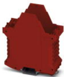
Component housing, color: red

Please be informed that the data shown in this PDF Document is generated from our Online Catalog. Please find the complete data in the user's documentation. Our General Terms of Use for Downloads are valid ( http://phoenixcontact.com/download )