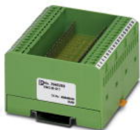
Component housing, length: 75 mm, color: green, width: 90 mm, height: 47.5 mm

Please be informed that the data shown in this PDF Document is generated from our Online Catalog. Please find the complete data in the user's documentation. Our General Terms of Use for Downloads are valid ( http://phoenixcontact.com/download )