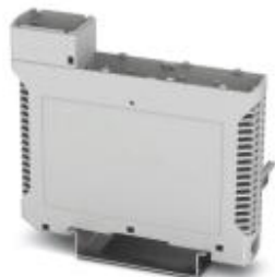
Housing base, for 10/10 bus connector, color: light gray

Please be informed that the data shown in this PDF Document is generated from our Online Catalog. Please find the complete data in the user's documentation. Our General Terms of Use for Downloads are valid ( http://phoenixcontact.com/download )