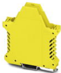
Component housing, Lower part, color: yellow, width: 22.5 mm

Please be informed that the data shown in this PDF Document is generated from our Online Catalog. Please find the complete data in the user's documentation. Our General Terms of Use for Downloads are valid ( http://phoenixcontact.com/download )