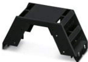
Upper part, color: black, width: 45 mm, height: 38.5 mm

Please be informed that the data shown in this PDF Document is generated from our Online Catalog. Please find the complete data in the user's documentation. Our General Terms of Use for Downloads are valid ( http://phoenixcontact.com/download )