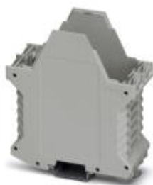
Component housing, length: 99 mm, Lower part, color: gray, width: 45 mm, height: 114.5 mm

Please be informed that the data shown in this PDF Document is generated from our Online Catalog. Please find the complete data in the user's documentation. Our General Terms of Use for Downloads are valid ( http://phoenixcontact.com/download )