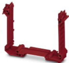
Component housing, Lower part, color: red, width: 22.5 mm

Please be informed that the data shown in this PDF Document is generated from our Online Catalog. Please find the complete data in the user's documentation. Our General Terms of Use for Downloads are valid ( http://phoenixcontact.com/download )