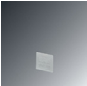
End cover, Length: 28 mm, Width: 1 mm, Height: 26.2 mm, Color: gray

Please be informed that the data shown in this PDF Document is generated from our Online Catalog. Please find the complete data in the user's documentation. Our General Terms of Use for Downloads are valid ( http://phoenixcontact.com/download )