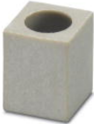
Bridge bar isolator, Color: gray

Please be informed that the data shown in this PDF Document is generated from our Online Catalog. Please find the complete data in the user's documentation. Our General Terms of Use for Downloads are valid ( http://phoenixcontact.com/download )