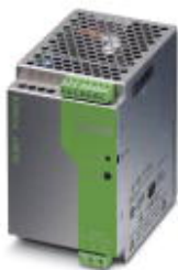
DIN rail power supply unit, primary-switched mode, 1-phase, output: 12 V DC / 10 A

Please be informed that the data shown in this PDF Document is generated from our Online Catalog. Please find the complete data in the user's documentation. Our General Terms of Use for Downloads are valid ( http://phoenixcontact.com/download )