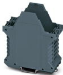
Component housing, length: 99 mm, Lower part, color: blue-gray, width: 45 mm

Please be informed that the data shown in this PDF Document is generated from our Online Catalog. Please find the complete data in the user's documentation. Our General Terms of Use for Downloads are valid ( http://phoenixcontact.com/download )