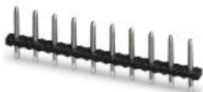
The figure shows a 10-position version

Pin strip, nominal current: 12 A, number of positions: 7, pitch: 5 mm, color: black, contact surface: Tin, mounting: THR soldering, The maximum current depends on the plug used. The lower of the two current values apply for plug and pin strip. The pin strip is made of highly temperature resistant plastic and is thus suitable for the reflow process.