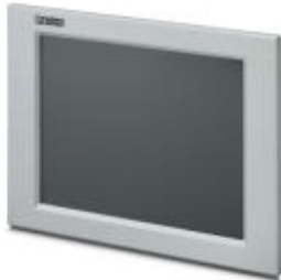
15-in. display shown

Please be informed that the data shown in this PDF Document is generated from our Online Catalog. Please find the complete data in the user's documentation. Our General Terms of Use for Downloads are valid ( http://phoenixcontact.com/download )