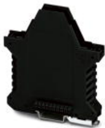
Component housing, length: 99 mm, Lower part, color: black, width: 17.5 mm, height: 114.5 mm

Please be informed that the data shown in this PDF Document is generated from our Online Catalog. Please find the complete data in the user's documentation. Our General Terms of Use for Downloads are valid ( http://phoenixcontact.com/download )