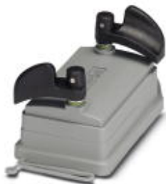
HEAVYCON ADVANCE IP65 protective cover B10, with bayonet locking, with retaining cord, diameter of retaining cord eyelet 3 mm

Please be informed that the data shown in this PDF Document is generated from our Online Catalog. Please find the complete data in the user's documentation. Our General Terms of Use for Downloads are valid ( http://phoenixcontact.com/download )