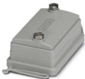
Protective cover IP65, for panel mounting side, with screw locking and retaining cord. B6, without logo

Please be informed that the data shown in this PDF Document is generated from our Online Catalog. Please find the complete data in the user's documentation. Our General Terms of Use for Downloads are valid ( http://phoenixcontact.com/download )