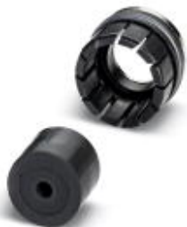
Unshielded cable clamp type cage, shielded: no, cable diameter range: 4 mm ... 6 mm

Please be informed that the data shown in this PDF Document is generated from our Online Catalog. Please find the complete data in the user's documentation. Our General Terms of Use for Downloads are valid ( http://phoenixcontact.com/download )