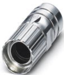
Cable connector, straight, shielded: yes, Screw locking, M23, cable diameter range: 3 mm ... 14.5 mm

Please be informed that the data shown in this PDF Document is generated from our Online Catalog. Please find the complete data in the user's documentation. Our General Terms of Use for Downloads are valid ( http://phoenixcontact.com/download )